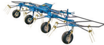
4 BASKET HAY TEDDER