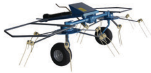
2 BASKET HAY TEDDER

Ranch Rite® Hay Tedders are perfect for a farmer looking to produce their own feed, or a land-owner looking to make some hay. Our tedders will help decrease your drying times on medium sized fields, allowing you to bale faster. The Ranch Rite® Hay Tedder does not rake the hay into a windrow, it fluffs the hay, decreasing dry time and increasing yield. All Ranch Rite® Hay Tedders come with OmniGear® and RPM Transmission® kits.